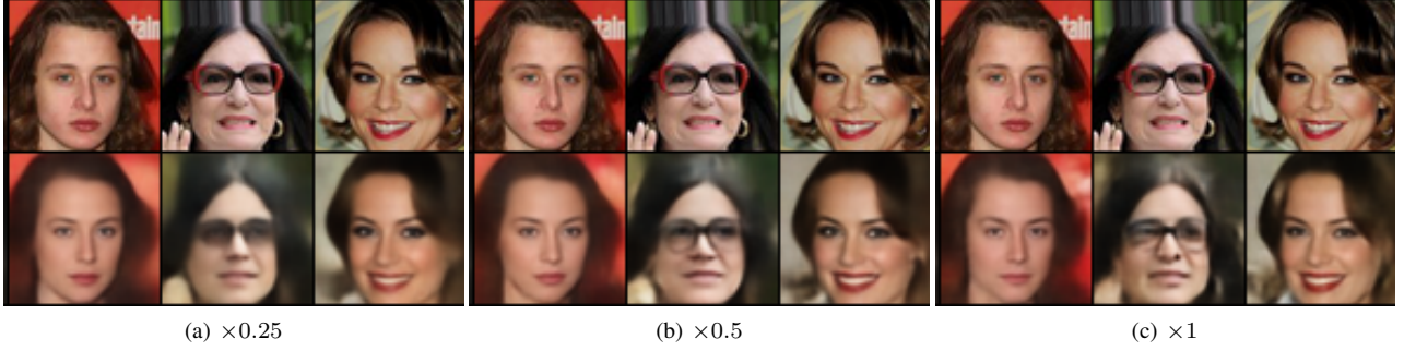
Figure 4. Reconstruction of test images for different width factors. The top and the bottom row of each case contains the original and reconstructed test images.

some reconstructed test images from the model and see that an increase of the network capacity allows to capture more details about the original images.