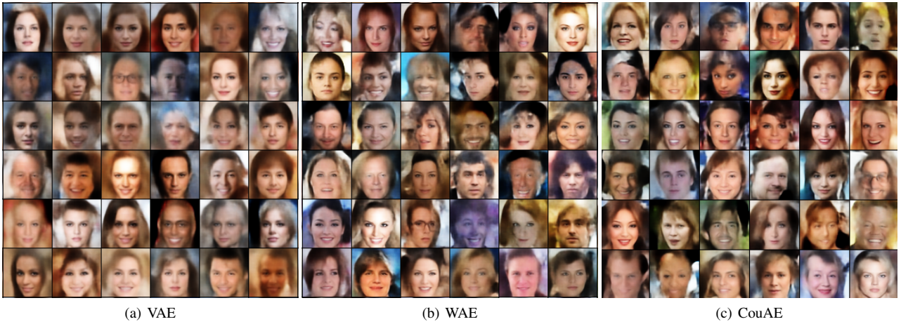
Figure 3. Generated samples on CelebA.

test samples from the true distribution. Results are averaged over 10 repetitions.