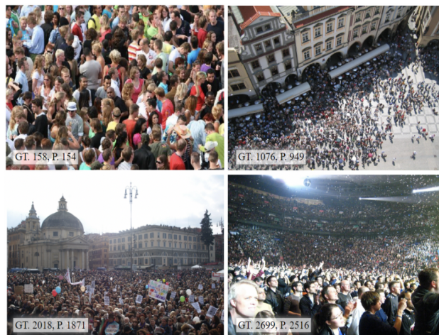
Figure 1. Representative images for challenges of non-uniform density, intra- and inter-scene variations in scale and perspective, and cluttering. In the figure, GT. means ground truth and P. means prediction made by our model.

Raising state-of-the-art performances in many works, density maps have shown undeniable contribution to the improvement of prediction precision. One advantage of being density map-based may be